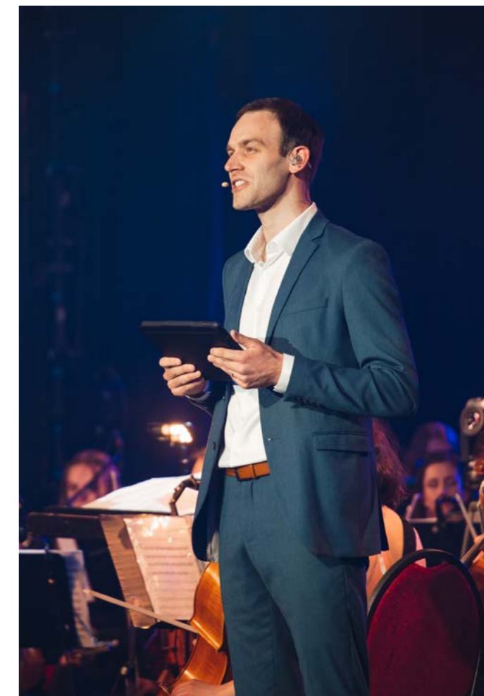
Mary's Meals Czech Republic 5th anniversary concert

Mary's Meals UK and Mary's Meals USA ran their annual matched-giving campaign at the end of 2023, allowing supporters to have their donations doubled. These campaigns remain highly successful at engaging existing supporters, but also draw new people into our movement. In addition, Mary's Meals UK offered to triple Direct Debits to encourage further donations.