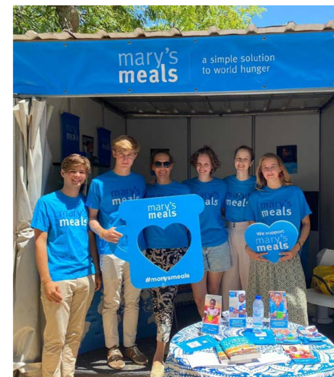
Mary's Meals volunteers at World Youth Day 2023